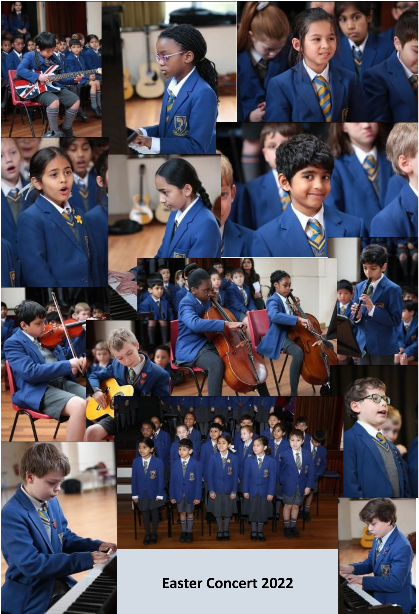
Easter Concert 2022