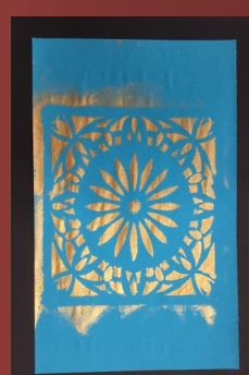
Look at our amazing Rangoli Pattern made from blocks!

Everyone joined in with making beautiful Rangoli patterns whether from blocks, beads, sequins or paints and stencils. We listened to the legendary story of Rama and Sita and were inspired to make puppets on craft sticks for re-enacting the story with friends. We also sculpted our own Diya Lamps out of clay, painted them in bright colours, and added sequins and a candle to light the way home for Rama and Sita from the story!