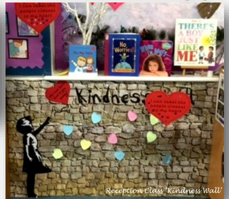
Reception Class 'Kindness Wall'