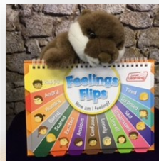
Our classroom 'Feelings Flips' book helps us to understand and show how we are feeling