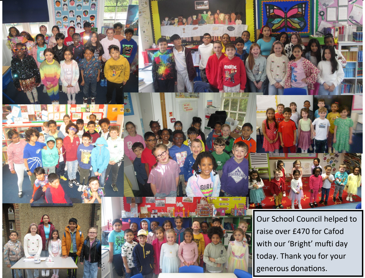
Our School Council helped to raise over £470 for Cafod with our 'Bright' multi day today. Thank you for your generous donations.