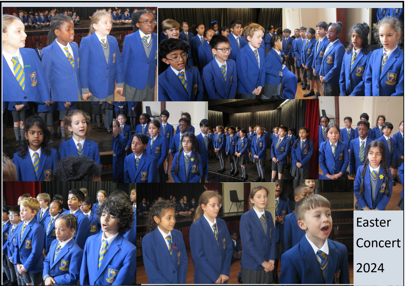
Easter Concert 2024