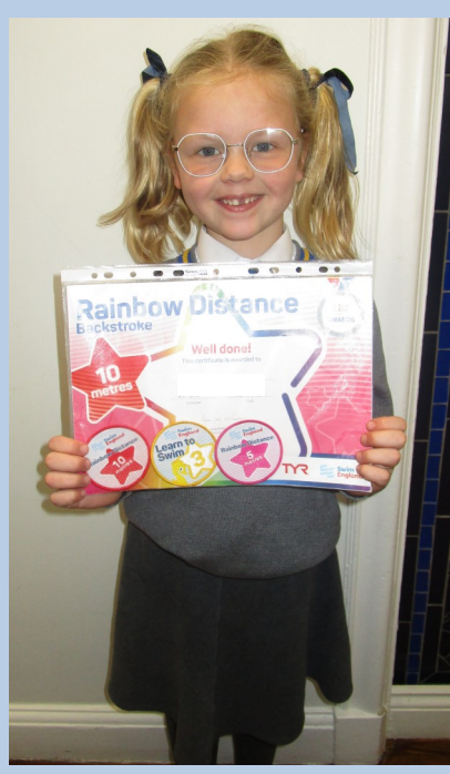
Well done to our Y2 swimming superstar who won a whole host of awards at her swimming lessons!