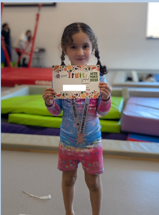
Well done to our Reception superstar Gymnast who earned this special award last week!